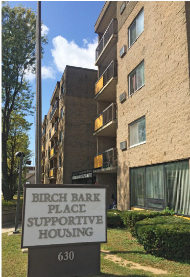
A senior development in Chicopee, MA included in the initial group of five pilot site assessments.

NEI conducted pilot resilience site assessments at five representative developments by building and resident type, location, and geography to begin to provide a portfolio-wide understanding of applicable resilience strategies. Initial cost estimates for the identified adaptation measures were prepared to enable DHCD and the local housing authority directors to understand the likely added costs to their capital budgets to enhance resiliency. NEI is currently conducting seven additional site assessments for developments most at risk from sea level rise.