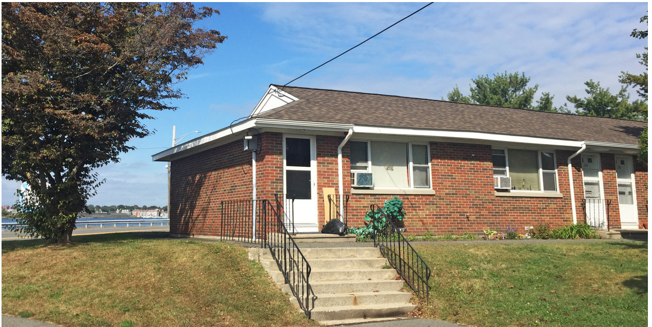
Above: A development in Salem, MA assessed for sea level rise and storm surge flooding risk mitigation opportunities.

Affordable and public housing has deferred capital needs, limited operating resources, many-layered regulatory requirements, and low-income residents whose vulnerability is compounded by climate-related risks. Through this project our team developed readily-deployable climate resilience tools to enable DHCD to direct capital funds and provide capacity building to local housing authorities to mitigate climate change vulnerabilities for the 80,000 residents living in DHCD-supported, locally-managed housing.